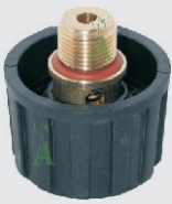
cod. 2768/90 (C25) 3/8" M - tappo vapore - safety steam cap