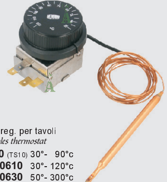
- termostato reg. per tavoli - adjustable tables thermostat cod. 2720/40 (TS10) 30°- 90°C cod. 2780/S0610 30°- 120°C cod. 2780/S0630 50°- 300°C