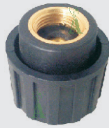
cod. 2768/92 (C32) 1/2" F - tappo vapore - safety steam cap