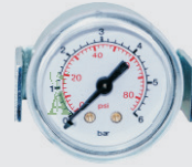
cod. 2770/10 (MV4)(A0001) - manometro ø41 1/8" 0-6bar - pressure gauge ø41 1/8" 0-6 BAR