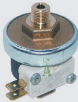
cod. 2769/80 (C22N) - pressostato 1/8" 2,8 BAR - pressure switch 1/8" 2.8 BAR