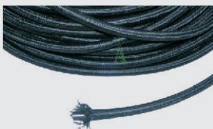
cod. 2760/10 (C27M) - tubo vapore in gomma a metraggio - steam rubber hose by length