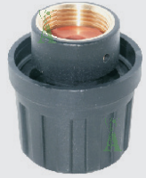
cod. 2768/96 (AR48) 3/4" F - tappo vapore antisvito - anti-unscrewing steam cap