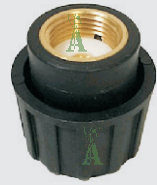
cod. 2780/O0770 5/8" F - tappo vapore - safety steam cap