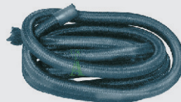
cod. 2700/50 (C27) - tubo vapore in gomma L=2 mt - steam rubber hose L=2 mt