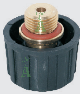
cod. 2768/94 (C23M) 1/2" M - tappo vapore - safety steam cap