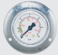
cod. 2707/48 (MV4F) - manometro ø41 1/8" 0-6bar - pressure gauge ø41 1/8" 0-6 BAR