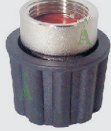
cod. 2700/32 (C32) 3/4" F - tappo vapore - safety steam cap