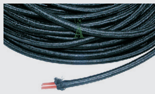
cod. 2760/11 (AR84) - tubo vapore in silicone a metraggio - steam silicone hose by length