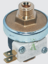
cod. 2700/6 (C22P)(A0072)(2780/O1100) - pressostato 1/4" 2,8 BAR - pressure switch 1/4" 2.8 BAR