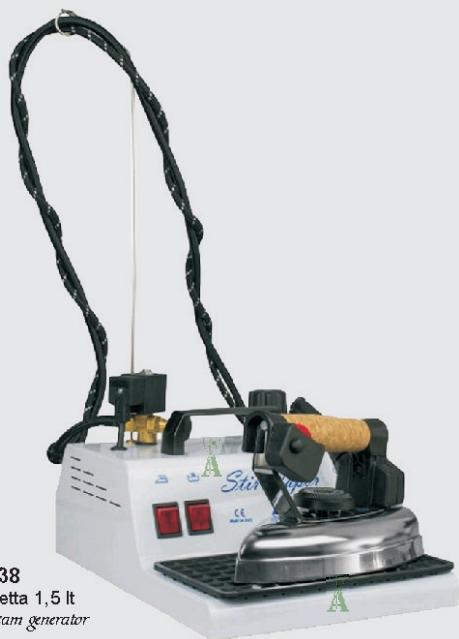
cod. 2738 - caldaietta 1,5 lt - 1,5 lt steam generator