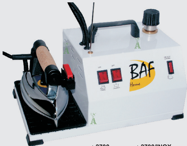
cod. 2700 - caldaietta 2 lt - 2 lt steam generator cod. 2700/INOX - caldaietta 2 lt INOX - 2 lt INOX steam generator