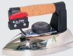
cod. 2705 - ferro di ricambio - replacement iron cod. 2705/S - ferro per mancini - left hand iron