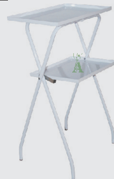
cod. 2700/01 - carrellino - trolley