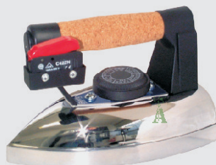
cod. 2705 - ferro di ricambio - replacement iron cod. 2705/S - ferro per mancini - left hand iron