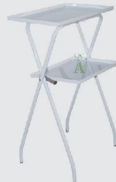
cod. 2700/01 - carrellino - trolley