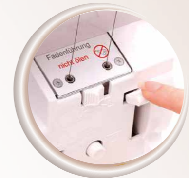
Jet-Air Threading™ System Developed by baby lock in 1993