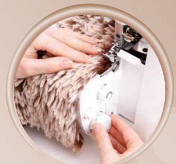
Clearly arranged controls