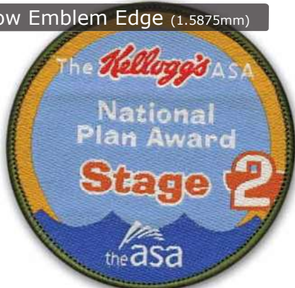
Narrow Patches and Emblems