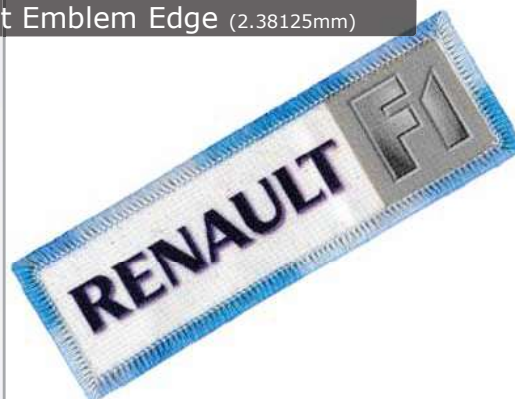
Small Patches and Labels