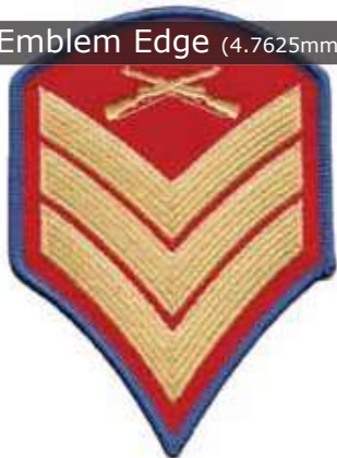
Military Badges And Insignias