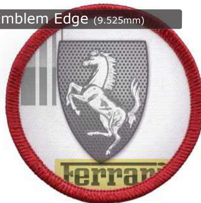
Company Insignias And Emblems