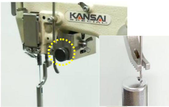
Upper feed system

Micro adjustment of feed amount is possible with this dial knob.