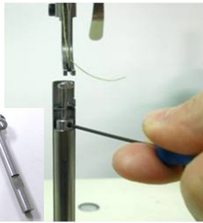
Specially designed looper

Micro adjustment of feed amount is possible with this dial knob.