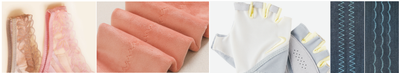
Bras Underwear Gloves Stitches

JK-2284B suitable for women's underwear, jackets, gloves, elastic reinforcement and other products zigzag sewing.